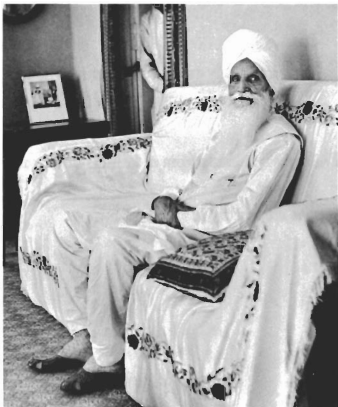
HAZUR MAHARAJ BABA SAWAN SINGH JI (1858-1948)