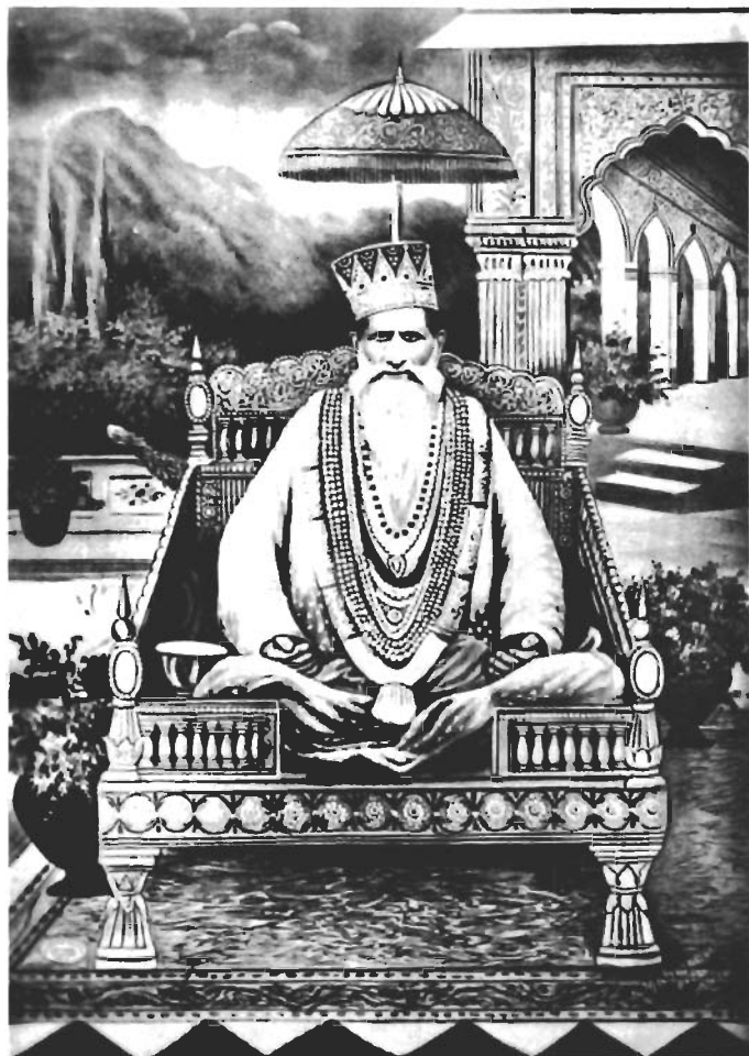
SWAMI JI MAHARAJ SHIV DAYAL SINGH (1818-1878)